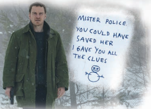
“Michael Fassbender in The Snowman”