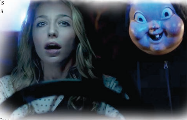
"Jessica Rothe in Happy Death Day"